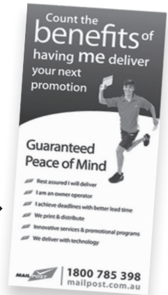
DL 99x210mm ▶

Interested? Fax or email us back with the following information.